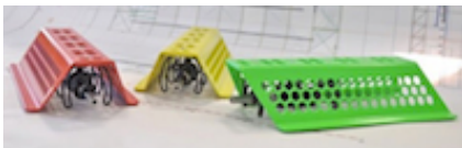
Some optional colours, shown with measurement microphones