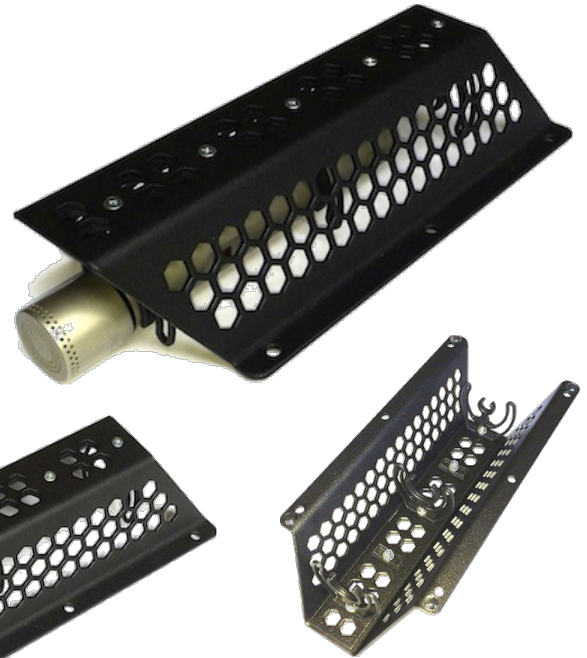
Bottom view showing the Rycote "Lyres", non-slip feet and the six fixing holes