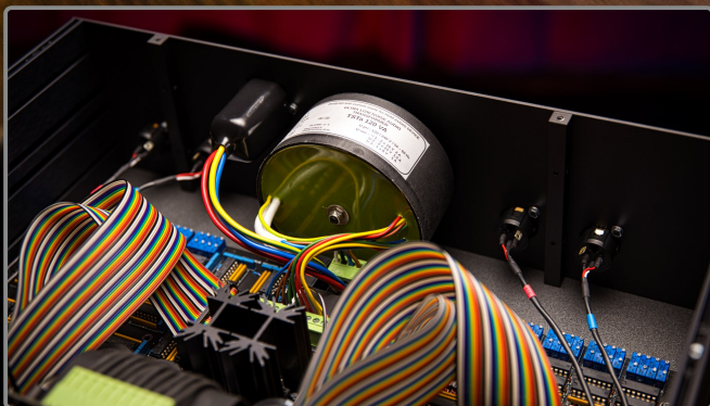
Power module with custom built transformer

To reach this extreme quality - we designed our own discrete opamps and used the best possible transistors, polystyrene capacitors, military spec resistors, top audio transformers and gold plated rotary and relay switches.