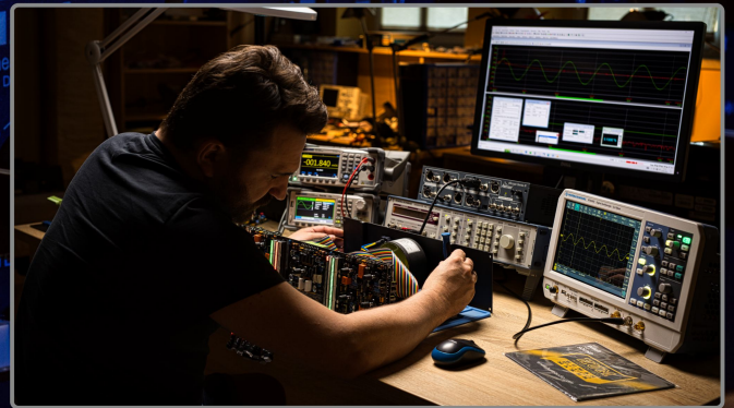
Calibration procedure in HUM Audio Devices Lab

All these settings are on rotary switches as you expect from mastering equipment. Left and Right channels detection circuits are stereo linkable. You can also use LAAL as two independent mono limiters if you wish.