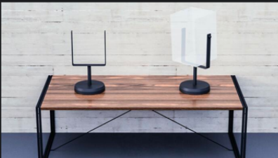
Table stand with cast base RL906